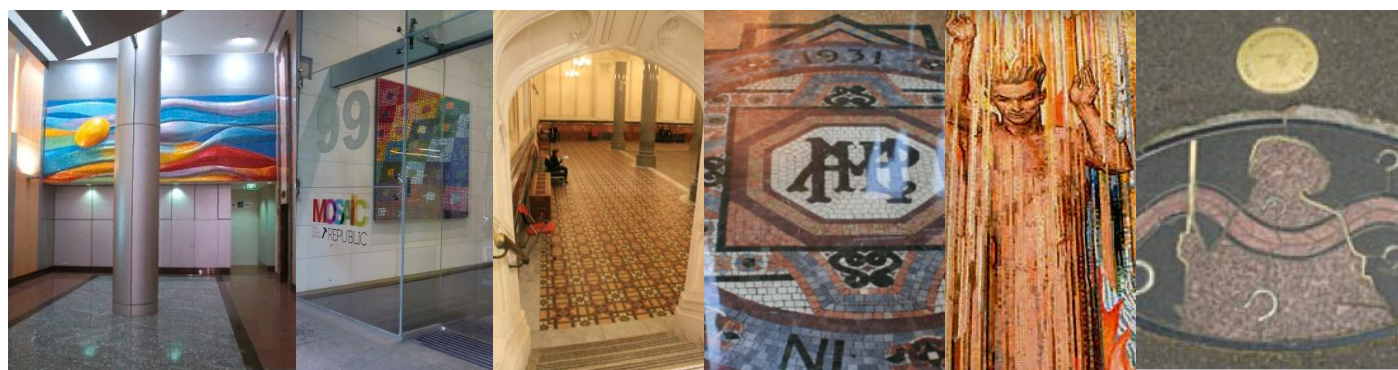
Relief Foyer Mural